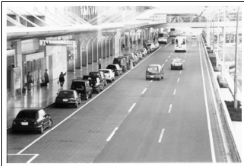
airport terminal, so

You will have eight minutes to complete this part of the test.